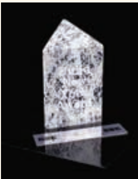
AGC NYS Build New York Award

Lehigh has been recognized with many awards over 40 years, but there are five construction accolades that have special significance, including a national honor for excellence in construction.