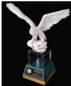
ABC National Award for Construction Excellence

Lehigh was honored with a prestigious National Excellence in Construction Award for this historical restoration by the Associated Builders and Contractors (ABC) for this project. ABC is the merit shop construction industry's voice with government and media.