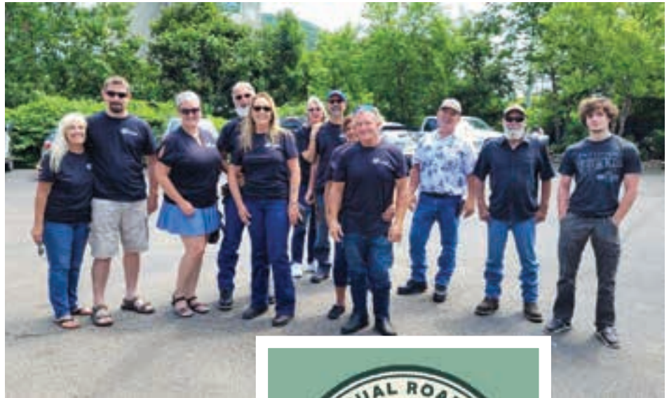
The Road Rally Crew arrived in thunderous style.

Participants established a unique logo and t-shirt suitable for riding and cruising, and the group made an impressive and loud entrance into the party.